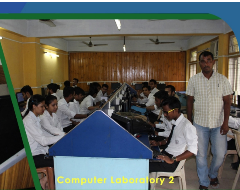
Computer Laboratory 2