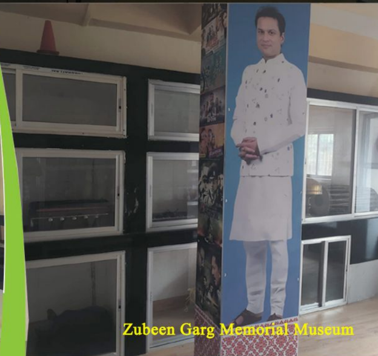
Zubeen Garg Memorial Museum