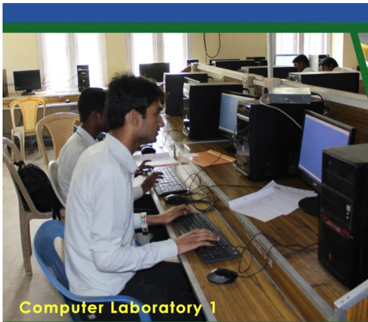
Computer Laboratory 1